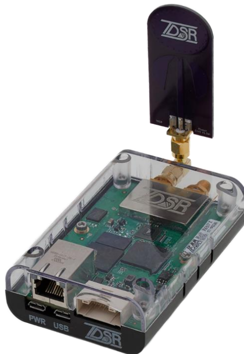
Fig. 1: P452 UWB Module with attached BroadSpec Antenna

This document also provides a reference of the message structures and bit patterns in an Ethernet UDP/IP programming interface. A separate application note, Using the USB and Serial Interfaces , describes the extended header bytes and protocol required to support both the USB and 3.3V TTL Serial UART interfaces.